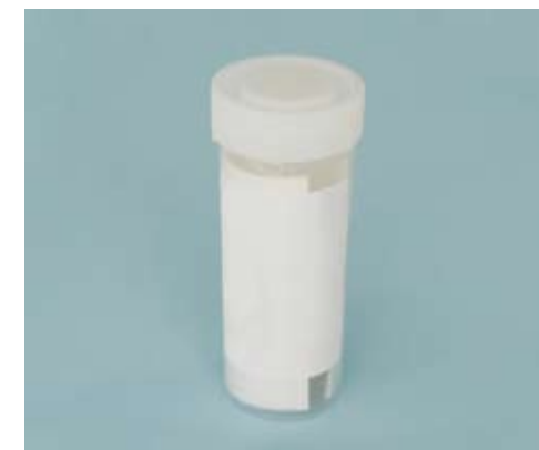
1 x container tube (containing absorbent pad and 1 x stool collection tube (inside the container tube))