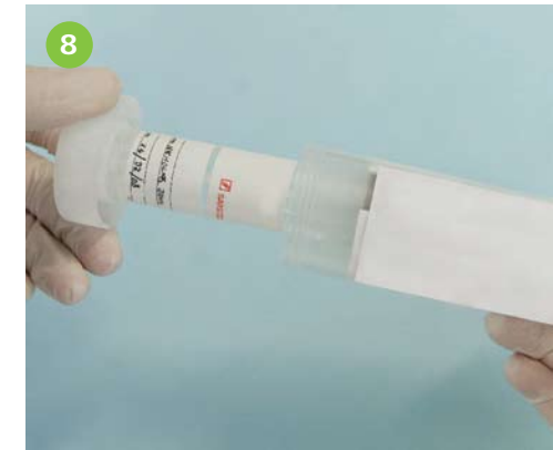
Place the stool collection tube in the larger container tube - this includes an absorbent pad - do not remove this. Screw on the lid of the larger tube. Take your gloves off by turning them inside out (so one glove ends up being inside the other), discard in the bin along with the paper strip from the toilet seat (which is NOT flushable). Then wash your hands thoroughly.