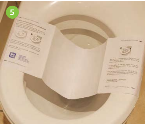
Stick the paper strip (sticky part) on the toilet seat as shown above. Once you have collected your sample in the paper stool collector, be careful not to contaminate it with urine or water. Your sample can also be collected using a clean and dry container or bag to then place in the container tube.