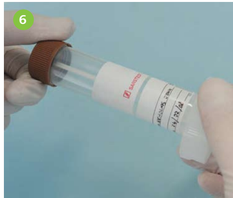
Unscrew the brown lid of the stool collection tube - this has a small spoon attached to it. Use the spoon to take eight 'pea sized' portions from different parts of your stool sample and place in the collection tube. Stir your sample using this spoon several times.