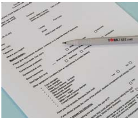
1 x customer details form 1 x pen