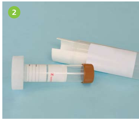
Open the container tube and remove the stool collection tube.