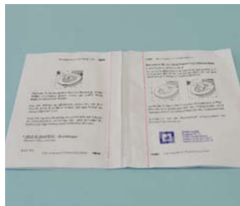
1 x paper stool collector