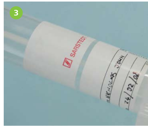
Write your name and today's date clearly on the side of the stool collection tube with the pen provided.