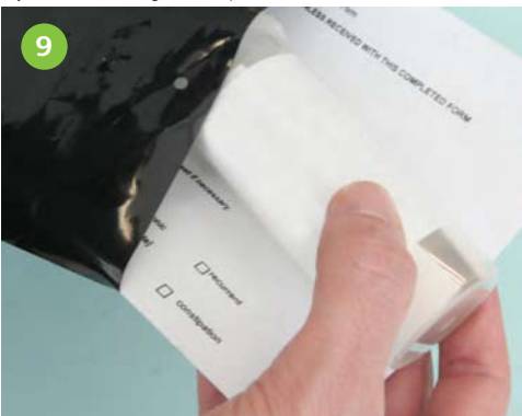
Place the tube and customer details form in the prepaid envelope provided. Seal the envelope with the clips included and post immediately.

Remember to include your customer details form, without this we cannot process your sample.