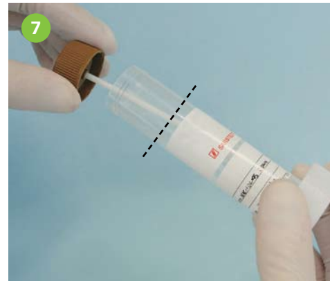
Please ensure tube is 3/4 full (as shown by the dotted line above). Screw on the lid of the collection tube tightly.