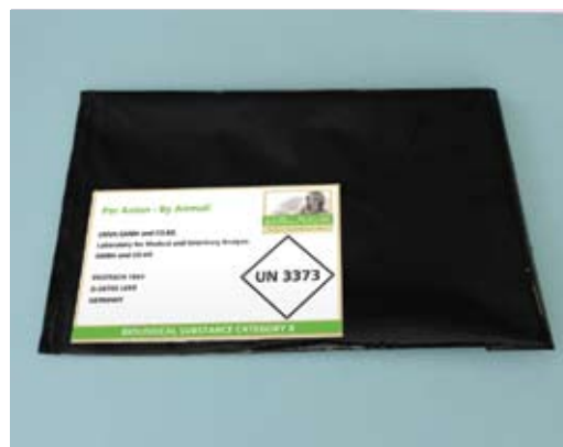
1 x prepaid envelope 2 x sealing clips