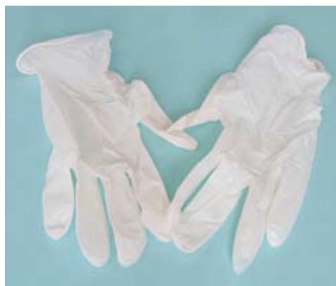
1 x pair of gloves