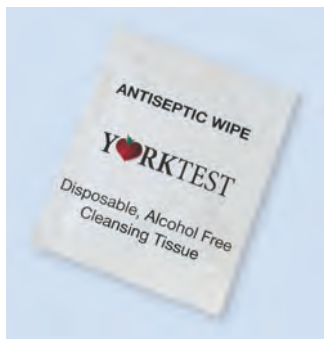
1 x antiseptic wipe