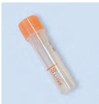
1 x orange collection tube