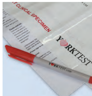
1 x customer details form 1 x prepaid envelope 1 x pen

YorkTest Laboratories Ltd York Science Park York YO10 5DQ United Kingdom