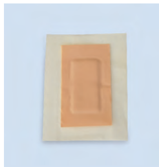
1 x plaster