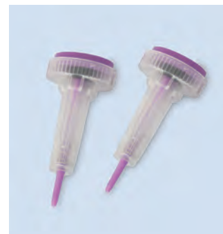
2 x single use lancets