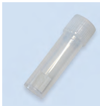
1 x container tube (containing absorbent pad)